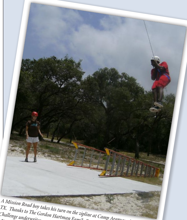
A Mission Road boy takes his turn on the zipline at Camp Aranzazu in Rockport, TX. Thanks to The Gordon Hartman Family Foundation, 2008 Shindig SOAR Challenge underwriter, and the Shindig Challenge Match supporters who sent all Mission Road kids to camp this summer.