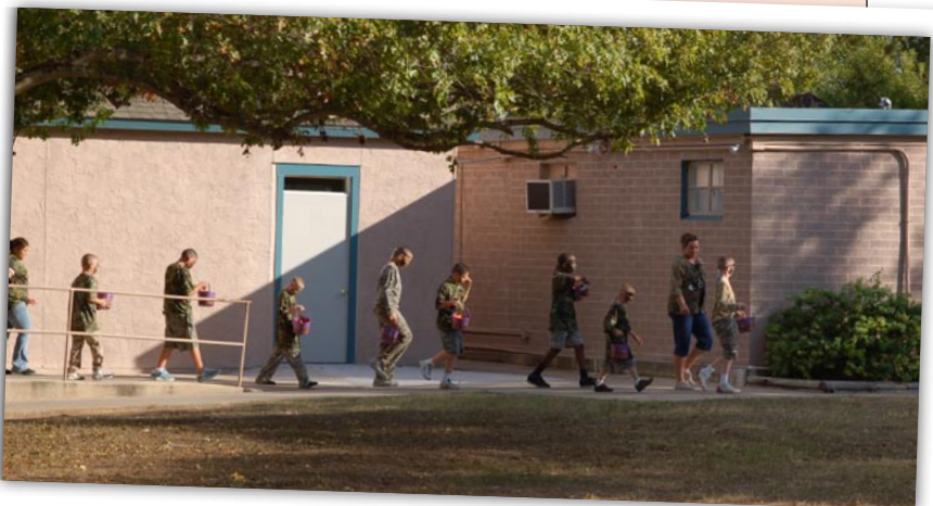
Mission Road kids, costumed in army camouflage, played Trick or Treat throughout the campus on Halloween.