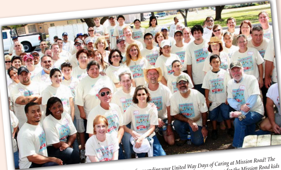
Sincere thanks to Southwest Research Institute employees for spending your United Way Days of Caring at Mission Road! The SWRI crew painted, mulched and planted gardens to beautify the campus. They brought a petting zoo for the Mission Road kids to enjoy, along with lunch, games and a balloon release. Wow!